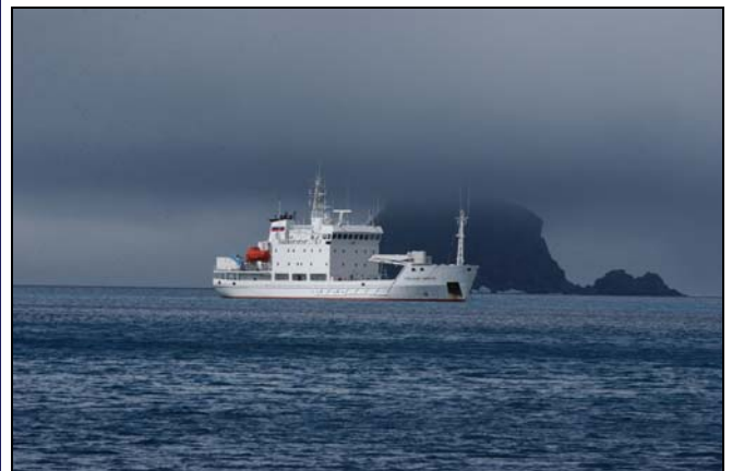
M/V Aleksy Maryshev passing South Orkney Islands.

The trip has an exploratory theme and we will spend as much time ashore as possible, wandering amongst the bewitching scenery and wonderful wildlife of the uttermost end of the Earth.